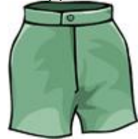
shorts (a pair of)