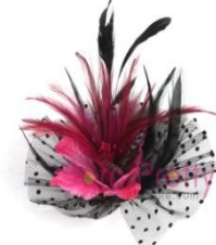
Fascinator/ hair ornament