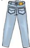
jeans (a pair of)