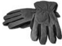
glove(s) (a pair of)