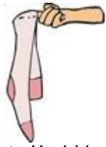
stocking(s) (a pair of)