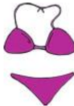
bikini(s) (top & bottom)