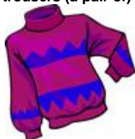
jumper(s) pullover(s) sweater (s)