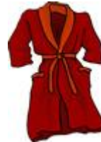
dressing gown(s) bathrobe (for the bathroom)