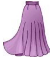
Skirt(s) ( a pleated skirt)