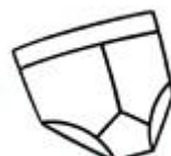
Y-fronts ( a pair of)