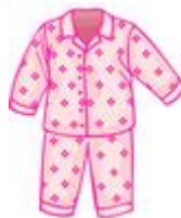
pyjama(s) (a pair of pyjamas)