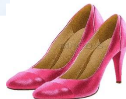
High heels (a pair of)