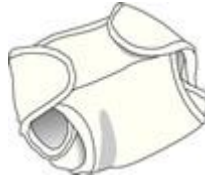
nappy (nappies)/ (AmE) diaper (diapers)