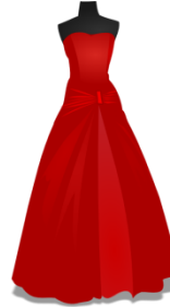
Gown (evening/night dress)