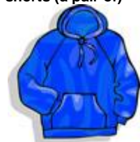
sweatshirt(s) with a hood = hoodie(s)