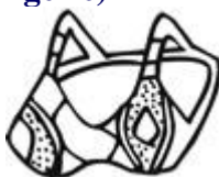
bra(s) (from brassiere)