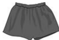
Boxers (a pair of)