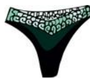
knicker(s) (a pair of)