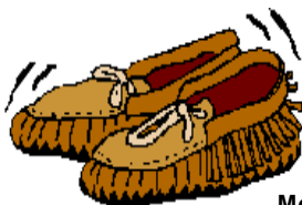
Moccasins (a pair of)