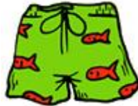
swimming trunks (a pair of)